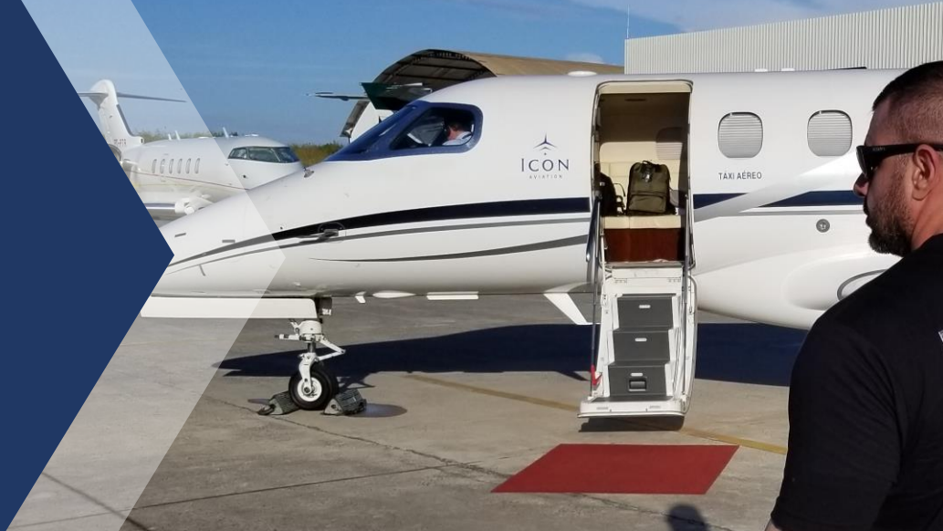
SECFOR Detail Brazil 2019